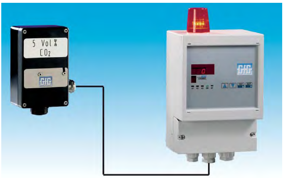
GMA81 A with IR24

All GfG transmitters are subject to 100% quality control. Installation is easy; since the transmitters are calibrated before shipment, the service engineer does a quick readjustment when putting them into operation.